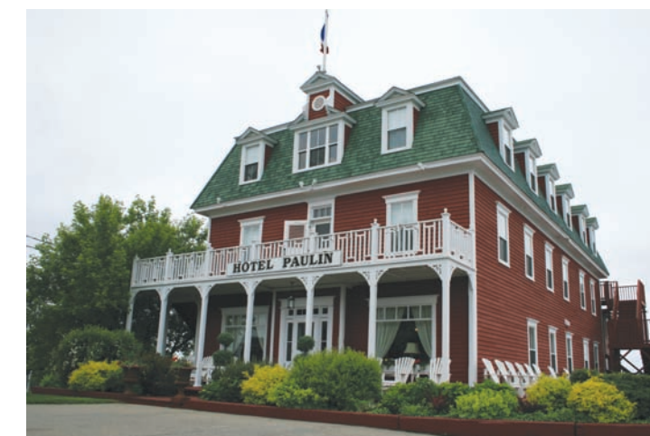
Hotel Paulin is a historical boutique-style inn situated on the Bay of Chaleur.