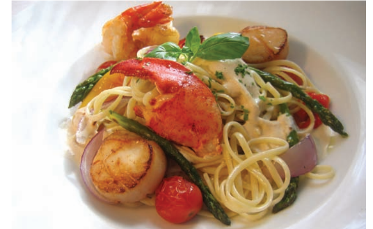
Succulent Seafood Linguini from Hotel Paulin.

Slipping over to Port Elgin, on the other side of the province, you’ll find a treasure called Little Shemogue (pronounced “shim-o-GWEE”)