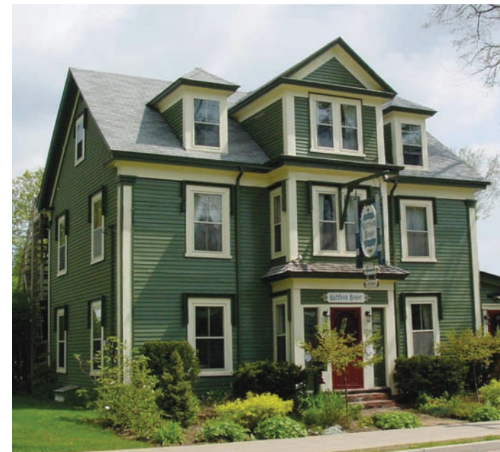
The Garrison House in Annapolis Royal has a chef who “wows” at every meal.