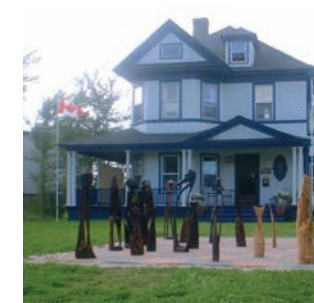
Haus Treuburg Country Inn and Cottages