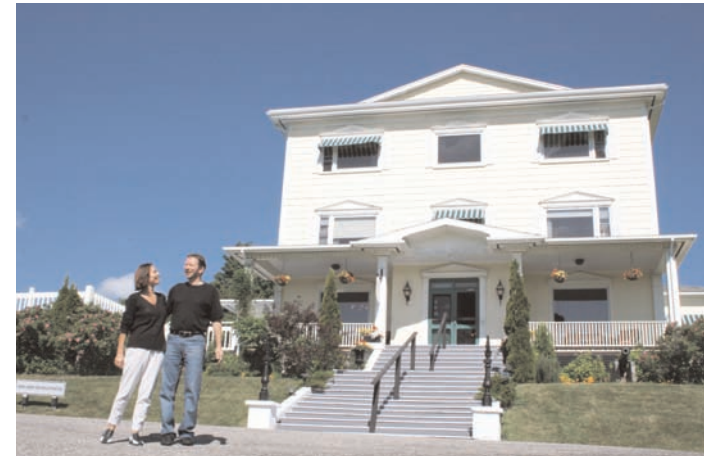
At the Rossmount Inn, evening dining is a feast for the eyes and palate.