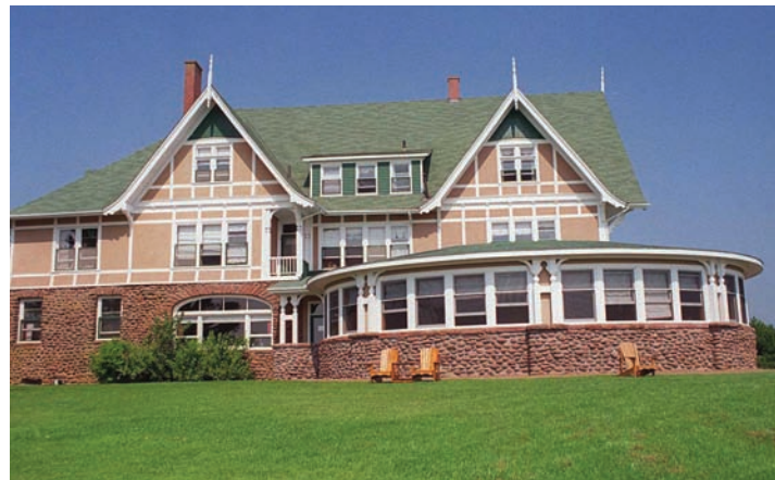
Dalvey By The Sea has kept its unique personality for more than 140 years.

Dalvey By The Sea has withstood a number of owners and changes, it has kept its unique personality for over 140 years.